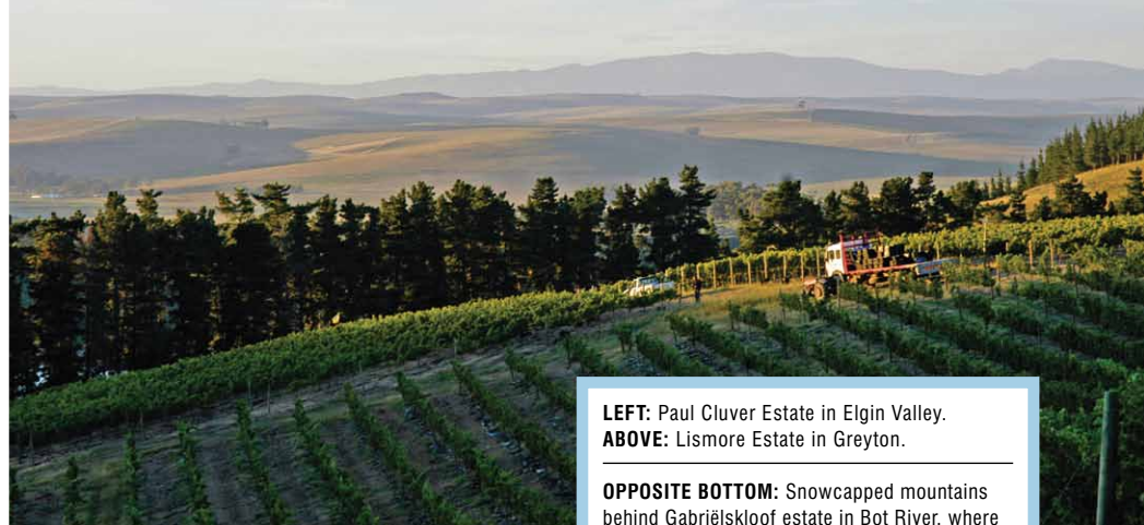
LEFT: Paul Cluver Estate in Elgin Valley. ABOVE: Lismore Estate in Greyton.