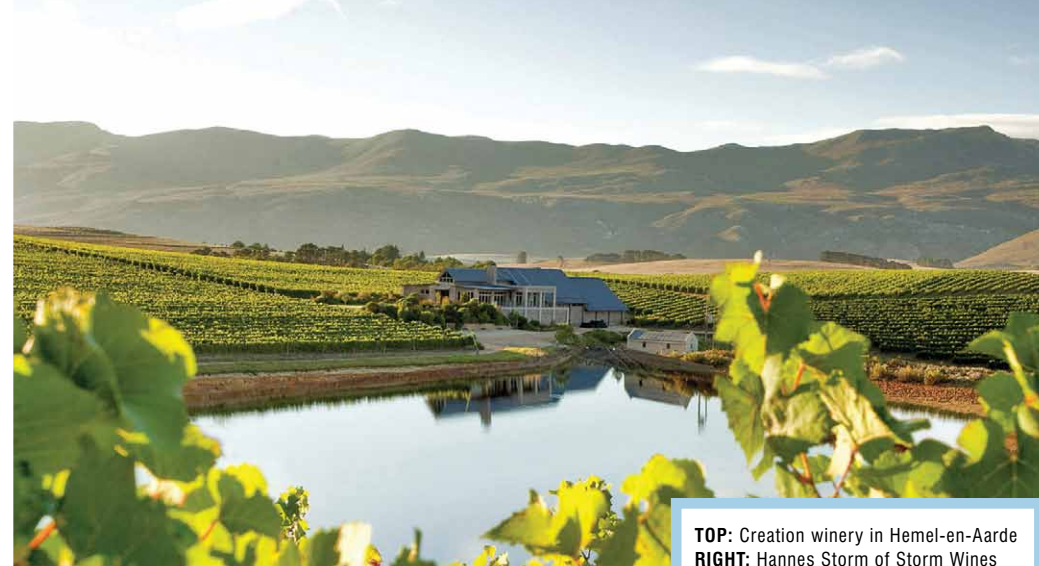
TOP: Creation winery in Hemel-en-Aarde RIGHT: Hannes Storm of Storm Wines